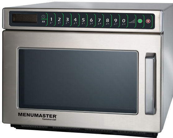
Model MDC182SA shown